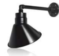
QTY 2 -3 Satin Black Gooseneck-Style Lighting Mounted Above